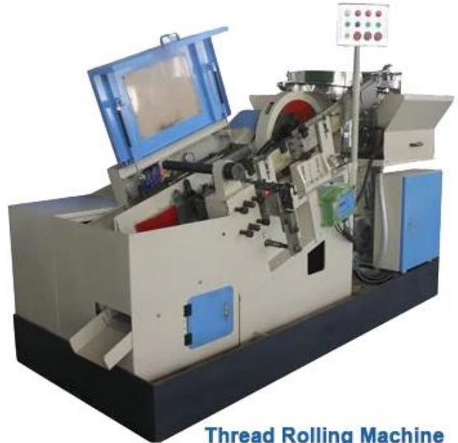
Thread Rolling Machine