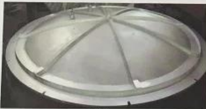
炉盖 The furnace cover