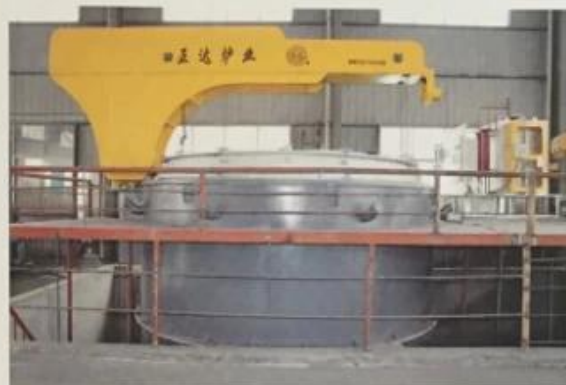
用于轴承行业球化炉 Used for the bearing industry