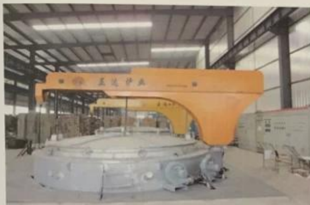
用于五金工具行业球化炉 Used for the hardware tool industry