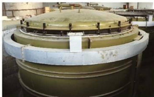
Well Type Electric Annealing Furnace (Main Furnace)