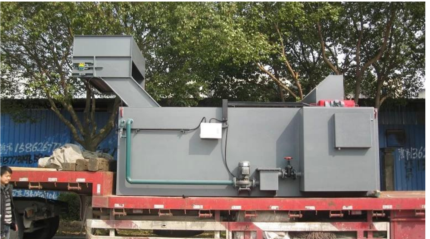
Quenching oil TANK: