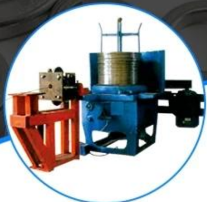
Belt wire drawing machine