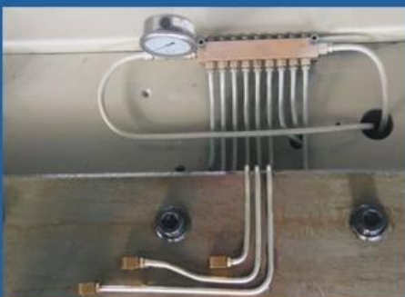
FORCIBLE OIL CARRYING It replaces traditional acrylic oiler which damaged main slider. This precision filter system not only lowers direct cost in production but also extend life usage in recycle.