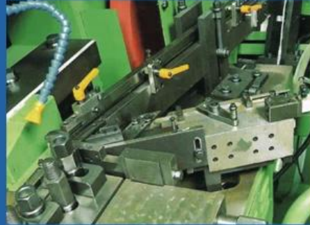
TRANSPORTATION MATERIAL Sloping filling-30 degree obliquity with main slider