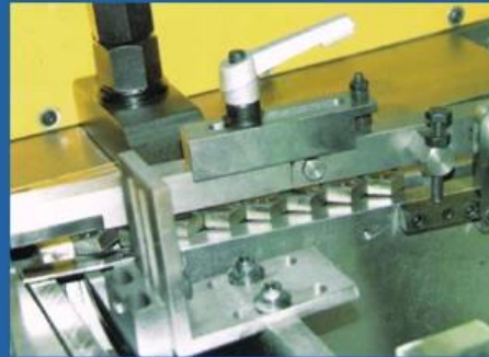
ORBITAL BRACKET To stabilize filling progress in order to avoid floating head and increases fine quality.