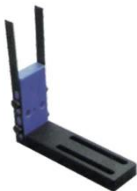
FLOATING HEAD-DETECTING, COUNTING, STOPPING DEVICE