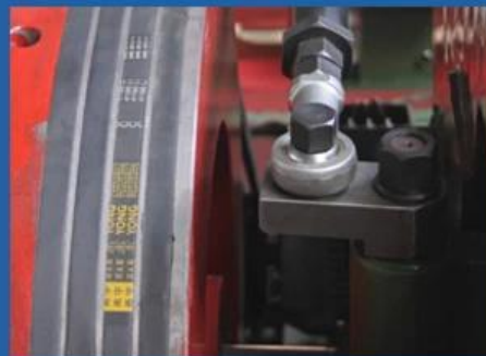
AUTO FEEDING SYSTEM Replced cam by auto feed system, effectively avoids the cam abrasion in the production process.