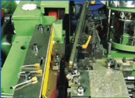
TRANSPORTATION MATERIAL Sloping filling-90 degree obliquity with main slider