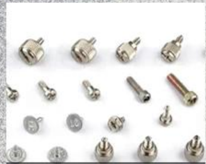
Flange Head Screw