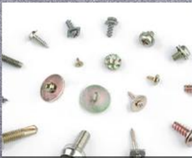
Screw With Washer