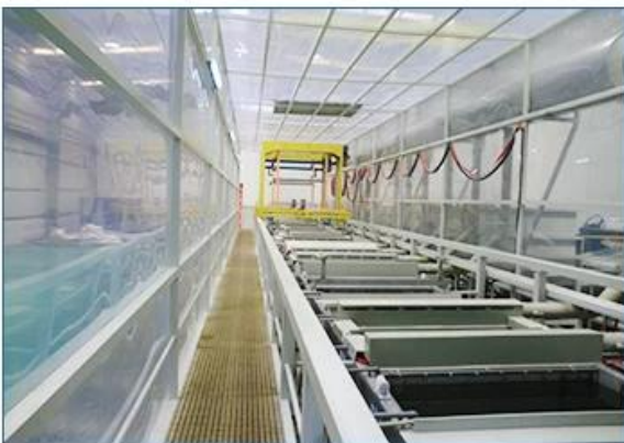
Phosphorization production line

Linear plating Automatic production line for mechanical parts, automobiles, motorcycle parts and other metal surface oxidation, nickel, chrome, galvanized and other process requirements, but also for engineering plastic surface of the metal plating, such as car decoration pieces, Mobile phone shell and signs and so on.