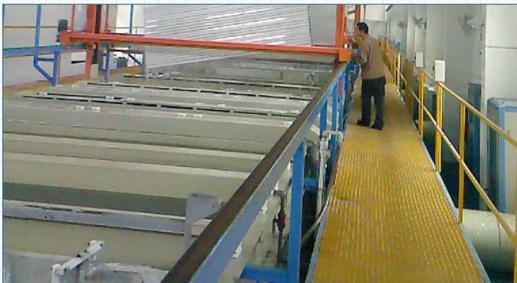
Aluminum profile anodizing line