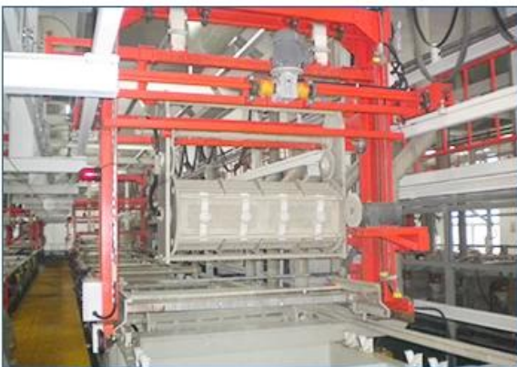
Nickel barrel plating line

Automatic plating production line is mainly applicable to all kinds of small parts and various non-standard items. The equipment is mainly composed of manipulator, tank body, drum, transmission mechanism, conveying device and so on, to meet the various products of different processes to the plating production.