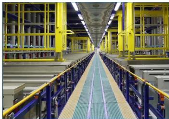
zinc electroplating line

Automatic plating production line is mainly applicable to all kinds of small parts and various non-standard items. The equipment is mainly composed of manipulator, tank body, drum, transmission mechanism, conveying device and so on, to meet the various products of different processes to the plating production.