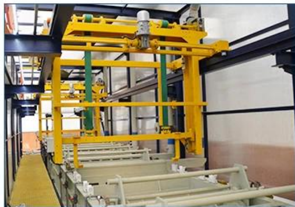
Zinc barrel plating line