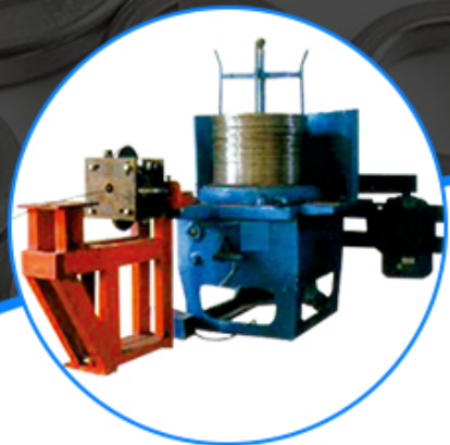
Belt wire drawing machine