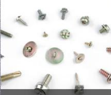
Screw With Washer