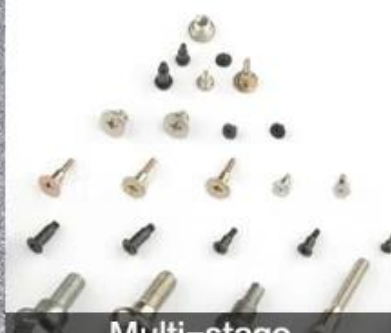
Multi-stage Special Shaped Screw