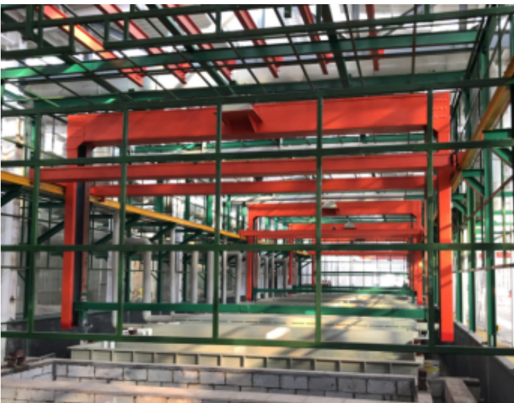
Fully auto acid washing crane