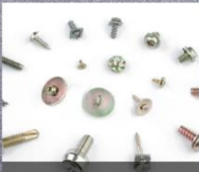
Screw With Washer