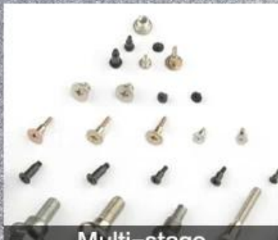
Multi-stage Special Shaped Screw