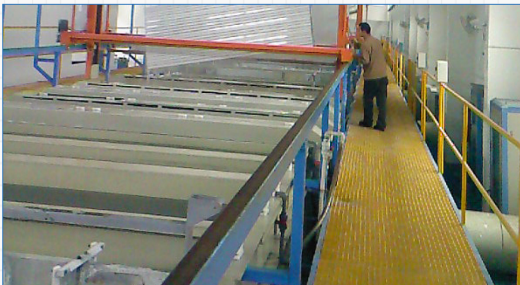
Aluminum profile anodizing line