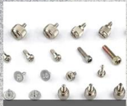
Flange Head Screw