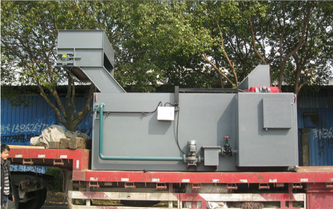
Quenchin Ooling□□□ □□□□□