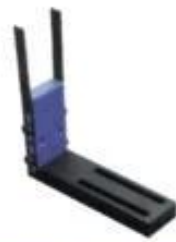
FLOATING HEAD-DETECTING, COUNTING, STOPPING DEVICE