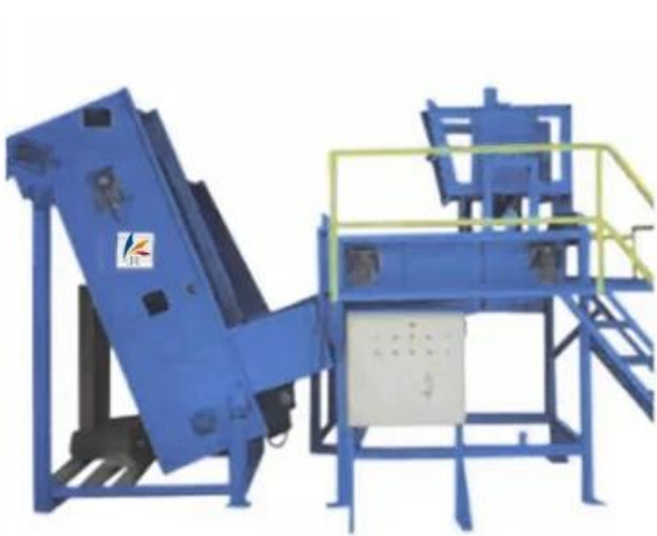
MAGNETIC-BELT TYPE FEEDER

The production chain composed of multiple machines is convenient for installation and transportation.