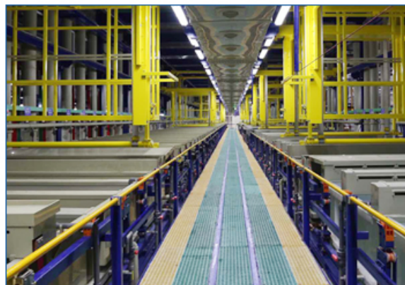
zinc electroplating line

Automatic plating production line is mainly applicable to all kinds of small parts and various non-standard items. The equipment is mainly composed of manipulator, tank body, drum, transmission mechanism, conveying device and so on, to meet the various products of different processes to the plating production.