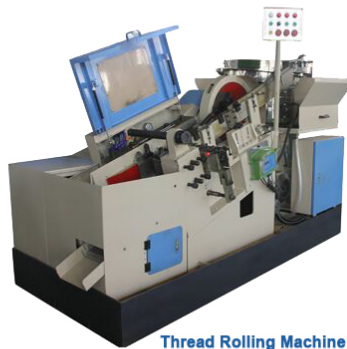
Thread Rolling Machine