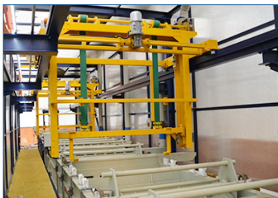
Zinc barrel plating line