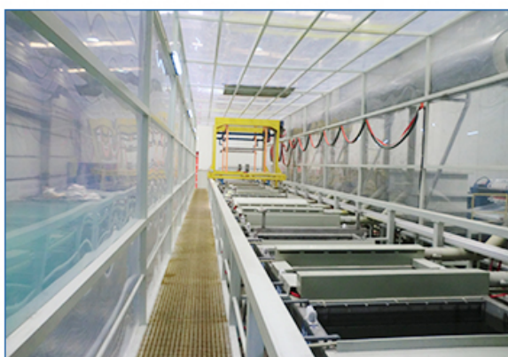
Phosphorization production line

Linear plating Automatic production line for mechanical parts, automobiles, motorcycle parts and other metal surface oxidation, nickel, chrome, galvanized and other process requirements, but also for engineering plastic surface of the metal plating, such as car decoration pieces, Mobile phone shell and signs and so on.