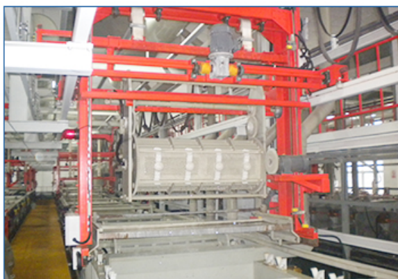
Nickel barrel plating line

Automatic plating production line is mainly applicable to all kinds of small parts and various non-standard items. The equipment is mainly composed of manipulator, tank body, drum, transmission mechanism, conveying device and so on, to meet the various products of different processes to the plating production.