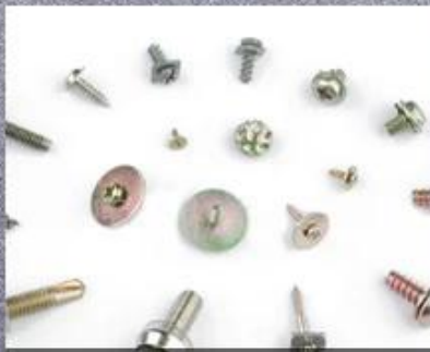
Screw With Washer