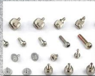
Flange Head Screw