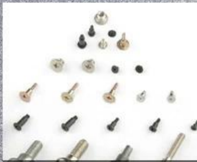
Multi-stage Special Shaped Screw