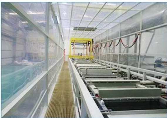
Phosphorization production line

Linear plating Automatic production line for mechanical parts, automobiles, motorcycle parts and other metal surface oxidation, nickel, chrome, galvanized and other process requirements, but also for engineering plastic surface of the metal plating, such as car decoration pieces, Mobile phone shell and signs and so on.