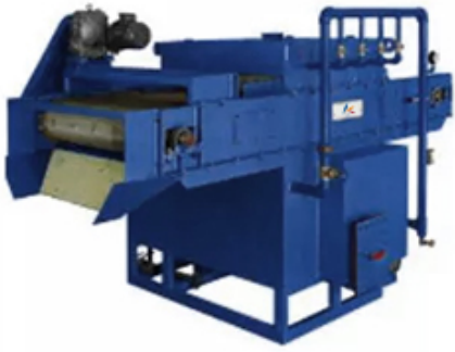
POST WASHING MACHINE