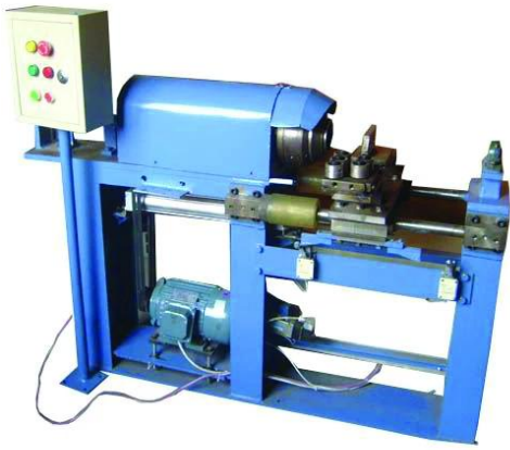
2 rolling up machine / coil machine.