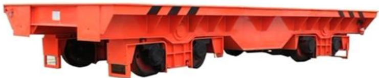
Rail Guided Vehicle