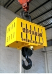
Round up vibration device