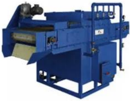
POST WASHING MACHINE