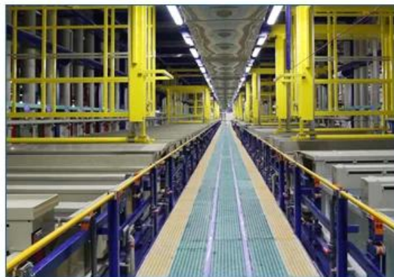
zinc electroplating line

Automatic plating production line is mainly applicable to all kinds of small parts and various non-standard items. The equipment is mainly composed of manipulator, tank body, drum, transmission mechanism, conveying device and so on, to meet the various products of different processes to the plating production.