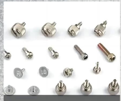
Flange Head Screw