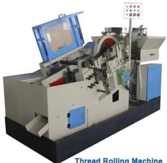
Thread Rolling Machine