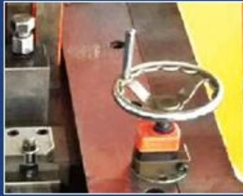
DIGITAL BAFFLING OPERATED BY HAND WHEEL