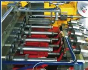
SLIDING SCREWED SLEEVE OF REAR K.O.