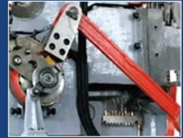
DIGITAL FEEDING OPERATED BY HAND WHEEL