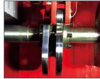
THE SWING OF GRIPPER IS DRIVEN BY CONJUGATE CAM