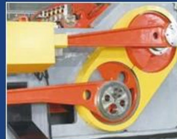
CUT OFF PART