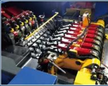
SWING PNEUMATIC GRIPPER