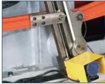
ELECTRICAL DIGITAL FEEDING