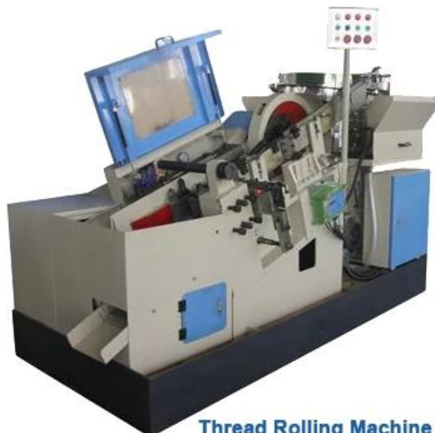
Thread Rolling Machine