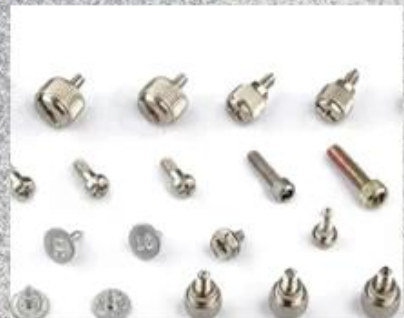
Flange Head Screw