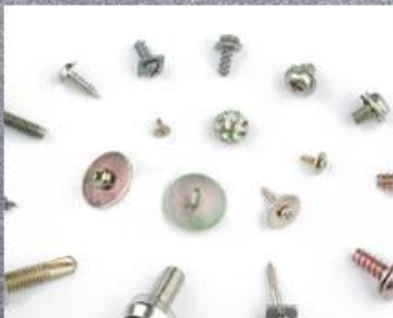
Screw With Washer