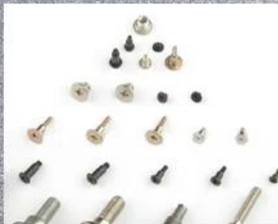
Multi-stage Special Shaped Screw