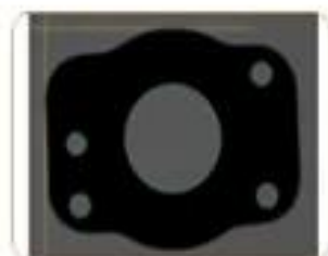
多个孔径 Multiple aperture