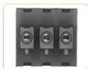
插槽宽度 Slot width