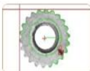
表面裂纹 Surface crack