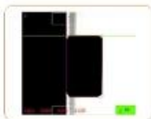
高度, 外径 Height, diameter