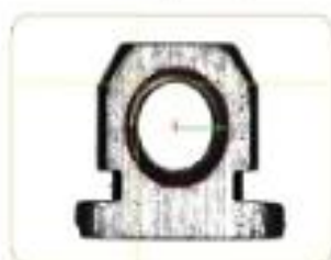
倒角直径 Chamfer diameter