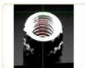
有无牙/牙距/牙数 W/Thread: Yes or No/Pitch Diameter/Thread Number