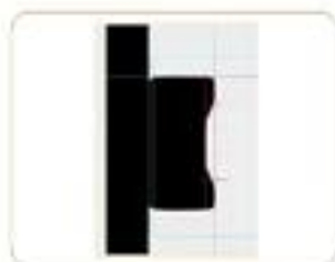
焊点高度 The solder joint height