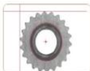
内倒角 Inner bevel