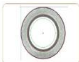
倒角/真圆度/内径/外径 Chamfer/Roundness/ Internal/External