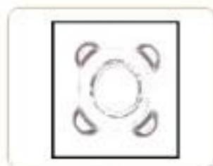
焊点面积 welding points area