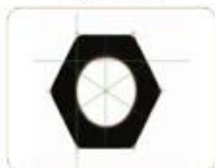
对角/对边 Across Corner/Across Flat