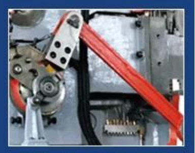
DIGITAL FEEDING OPERATED BY HAND WHEEL