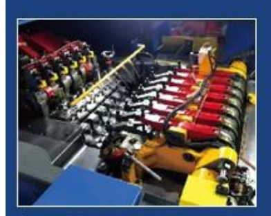
SWING PNEUMATIC GRIPPER