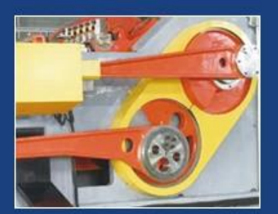
CUT OFF PART