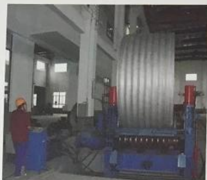
波纹桶成型 Corrugated molding