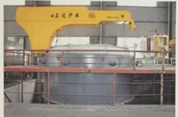
用于轴承行业球化炉 Used for the bearing industry