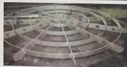
置料架 Loading frame