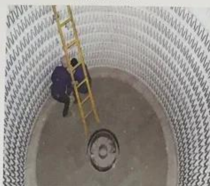
电加热炉 Electric heating furnace