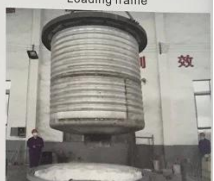
波纹桶 Corrugated bucket