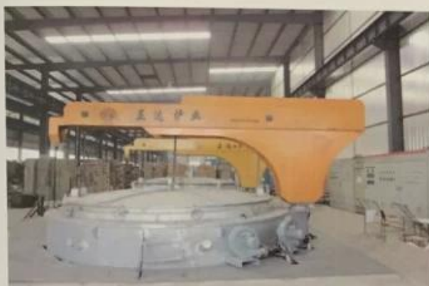
用于五金工具行业球化炉 Used for the hardware tool industry