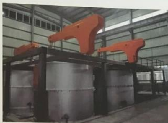
用于汽配行业球化炉 Used for the auto parts industry