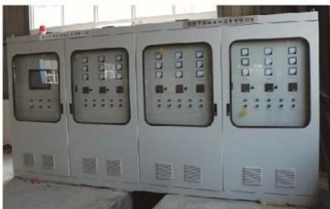
Electric Control Cabinet