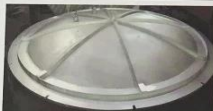
炉盖 The furnace cover

炉体安装吊高 (无脚架) Installation lifting of furnace body