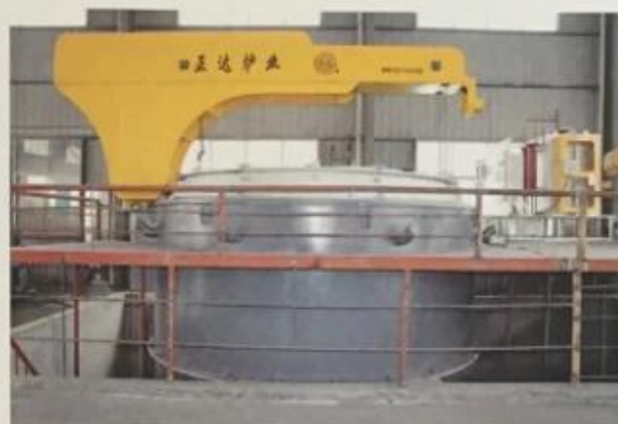
用于轴承行业球化炉 Used for the bearing industry