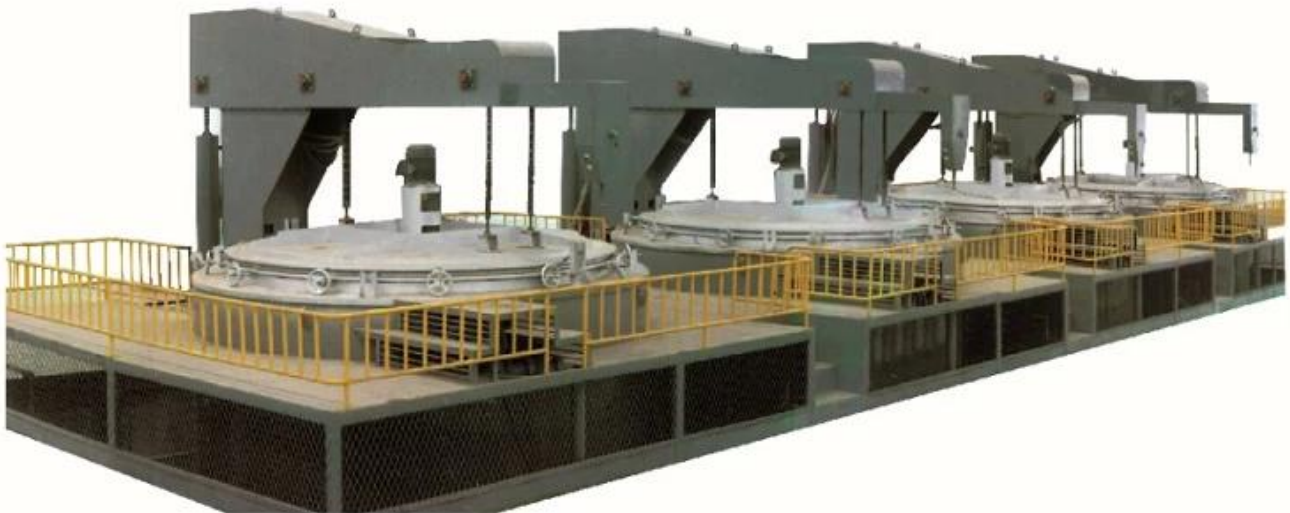
Well Type Electric Annealing Furnace