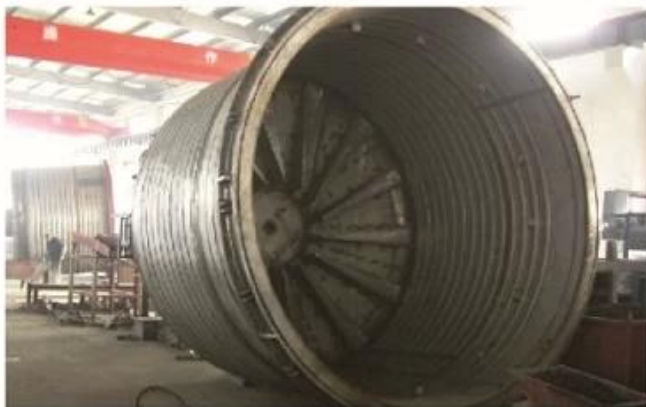
Liner of Well Type Electric Annealing Furnace