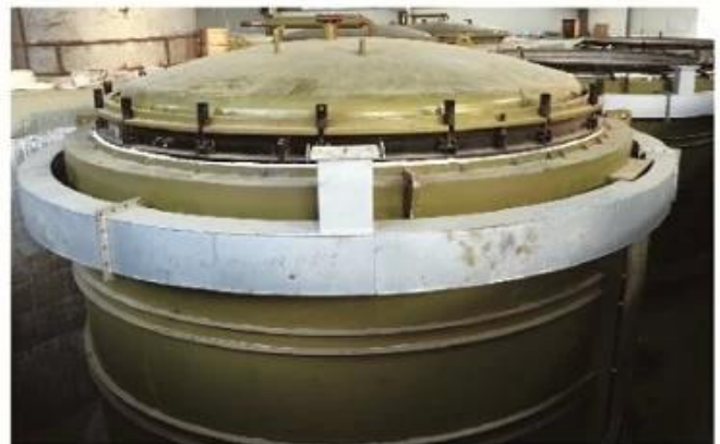
Well Type Electric Annealing Furnace (Main Furnace)