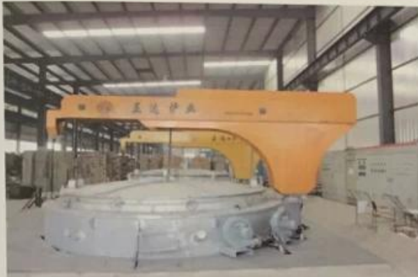
用于五金工具行业球化炉 Used for the hardware tool industry