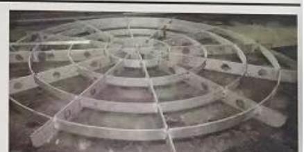
置料架 Loading frame