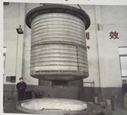
波纹桶 Corrugated bucket