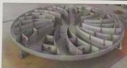
导流板 Air deflector