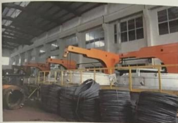
用于标准件行业球化炉 Used for fastner industry