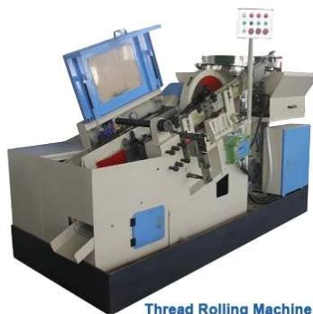
Thread Rolling Machine