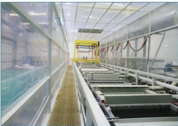
Phosphorization production line

Linear plating Automatic production line for mechanical parts, automobiles, motorcycle parts and other metal surface oxidation, nickel, chrome, galvanized and other process requirements, but also for engineering plastic surface of the metal plating, such as car decoration pieces, Mobile phone shell and signs and so on.