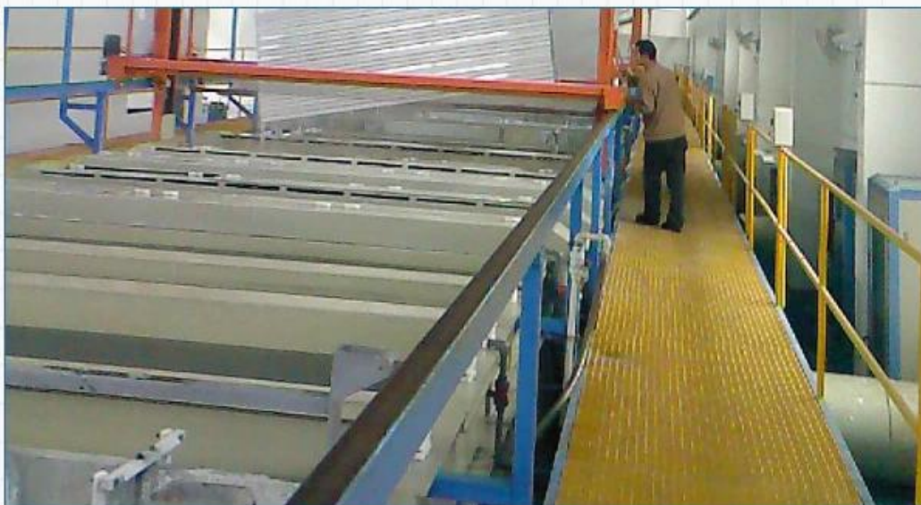
Aluminum profile anodizing line