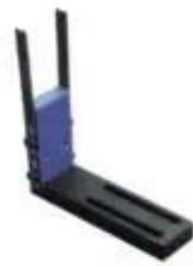
FLOATING HEAD-DETECTING, COUNTING, STOPPING DEVICE