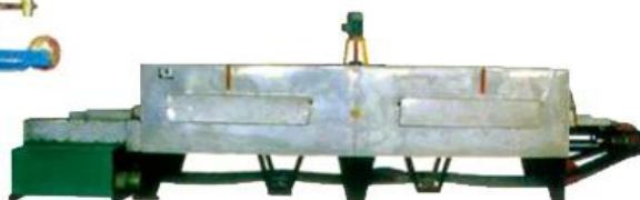
Washer Tempering Furnace