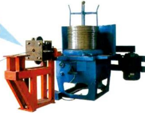
Belt Wire Drawing Machine