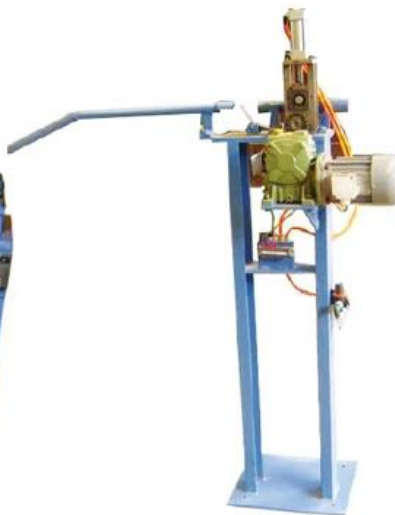
Coil Collection Machine