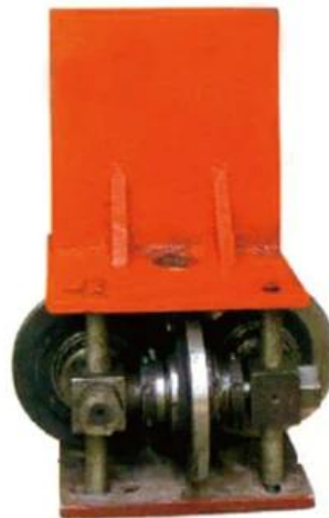
Die for Belt Wire Drawing