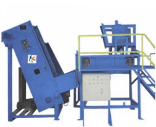
MAGNETIC-BELT TYPE FEEDER

The production chain composed of multiple machines is convenient for installation and transportation.