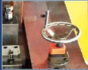
DIGITAL BAFFLING OPERATED BY HAND WHEEL