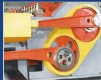
CUT OFF PART