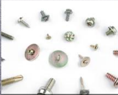
Screw With Washer