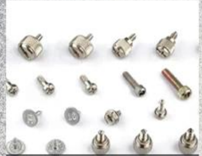
Flange Head Screw