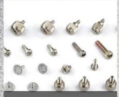
Flange Head Screw