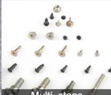
Multi-stage Special Shaped Screw