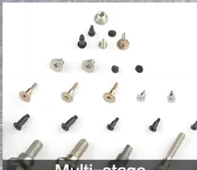
Multi-stage Special Shaped Screw