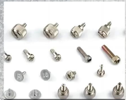
Flange Head Screw