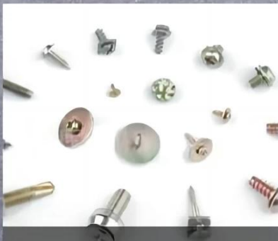
Screw With Washer