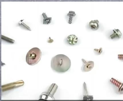
Screw With Washer