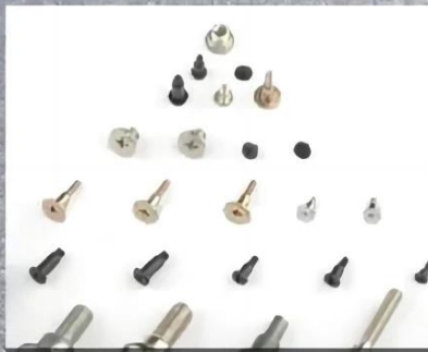
Multi-stage Special Shaped Screw