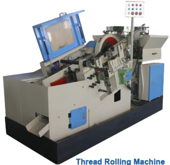
Thread Rolling Machine