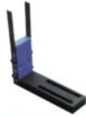
FLOATING HEAD-DETECTING, COUNTING, STOPPING DEVICE