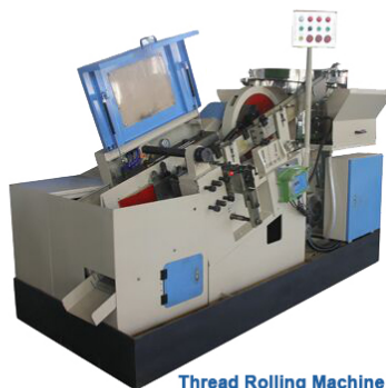
Thread Rolling Machine